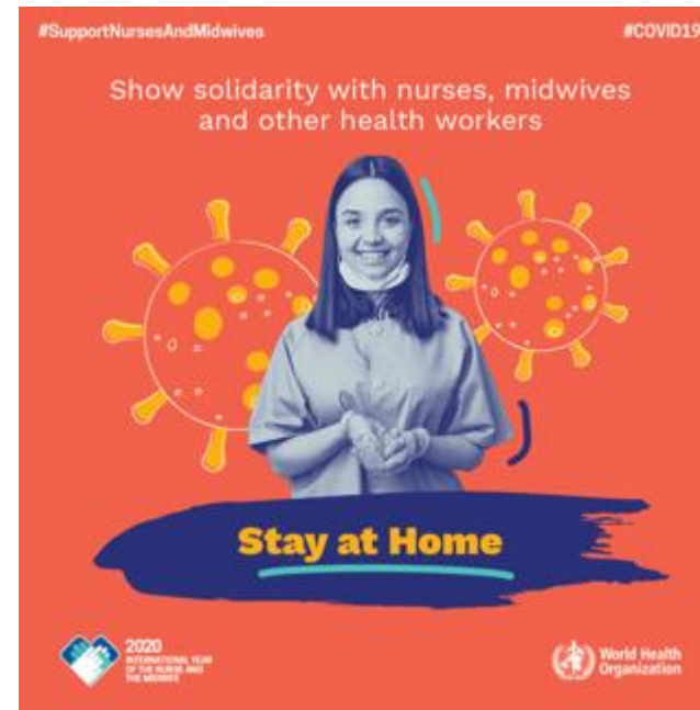
COVID-19 survey for health workers