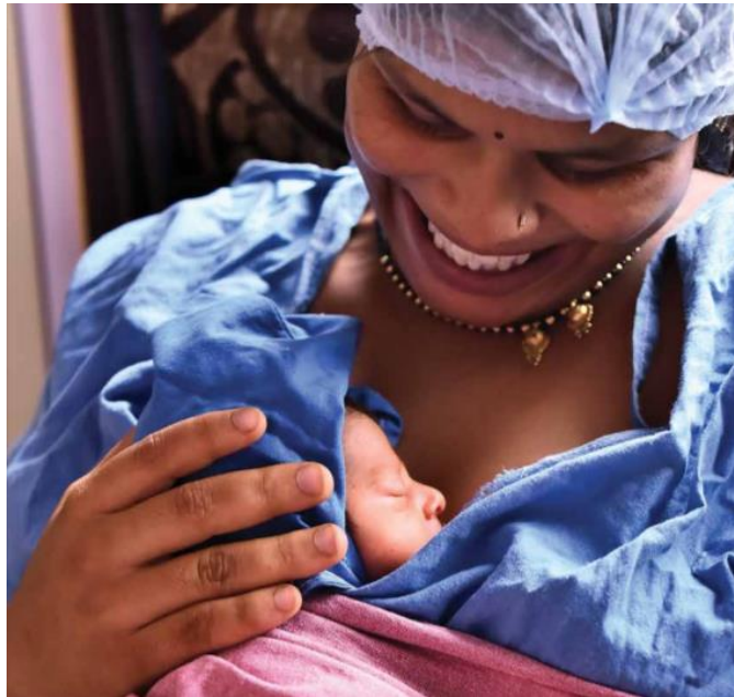
Survive and Thrive webinar series